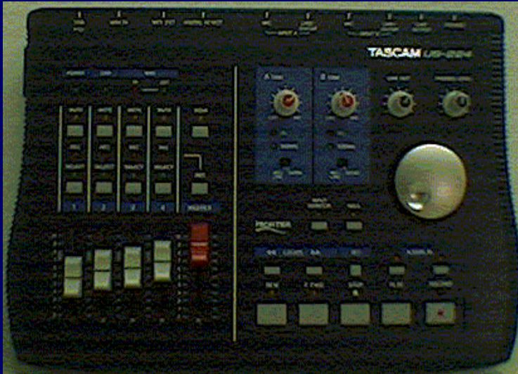
Digital Audio Workstation Controller (US-224)