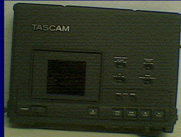
Digital Audio Tape Recorder (DA-P1)